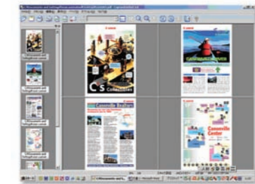
Thumbnail images / Multi-window images